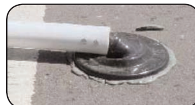
STOCK # RPMCF336WH3Y